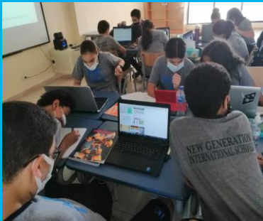
MS Advance Classes