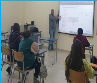
ACT & EST