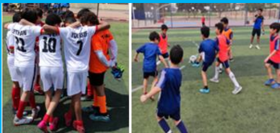
'SPORTS is ETHICS' الرياضة أخلاق