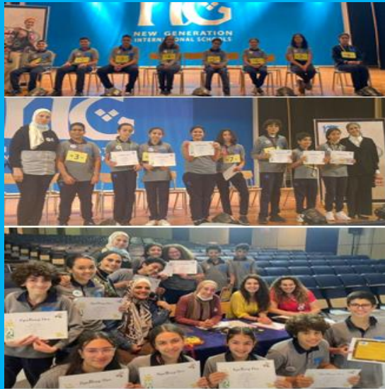
MS 'Spelling Bee' Competition