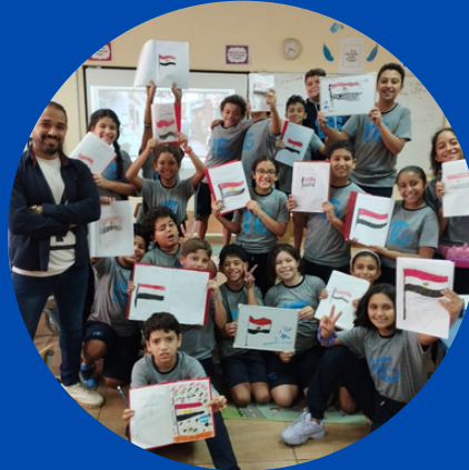
Armed Forces Day