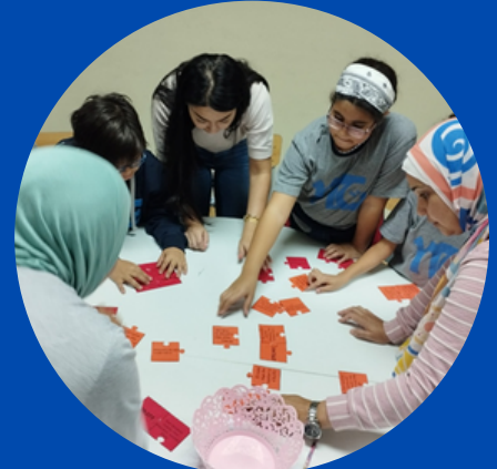
Elementary Family Math Day