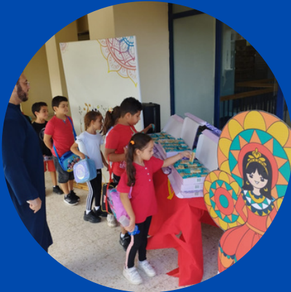
Mawlid Al Nabawi