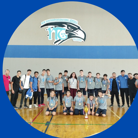
ISSOC Boys Under 14 Basketball Tournament 1st Place