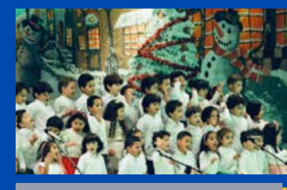
Teachers' Fun Day

Preschool & KG's Winter Show 'Friendship'