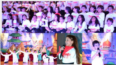
Grades 1 & 2 Performance