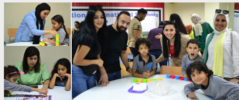
Elementary Family Math Day