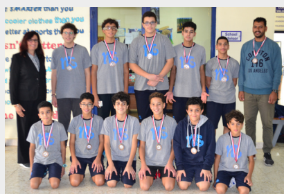
ISSOC Tournament for MS