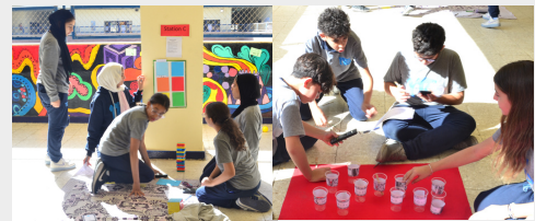
MS Math Activity: Math Experiential Learning

The MS Annual Show is around the corner! Save the date and be prepared to attend our massive performance on Friday, January 19th, 2024. We promise to dazzle you with a one-of-a-kind experience that includes our NG core values, such as teamwork and leadership skills, in a spectacular show. Your presence is crucial and matters to us! Stay tuned for more details.