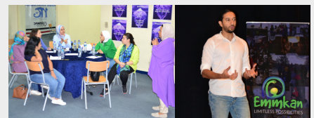
Parent Education Series

MS students were provided with learning opportunities that extended beyond the classroom to enhance their experience and achieve positive educational outcomes, which were witnessed on our balcony.