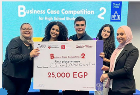
Business Case Competition for High School

Grades 8 - 12 advisory program at New Generation International Schools plays a crucial role in guiding students toward their future career paths. The program empowers students to make informed decisions about their academic and professional journeys by providing personalized guidance and fostering a proactive approach to career exploration. The effectiveness of the school's advisory program is evident in the university enrollment of seniors last year. Notably, 34 students aspired to pursue engineering, and remarkably, 33 of them were successfully admitted. Similarly, 16 students aimed for medical careers, with 11 securing admissions. Finally, 39 students sought humanities and business, resulting in 28 joining business programs and 17 pursuing humanities. These statistics highlight the effectiveness of the student advisory program in guiding students toward their desired academic paths. They demonstrate that when provided with proper direction, guidance, and support, NG students are more likely to achieve their aspirations and gain admission into the universities of their choice.