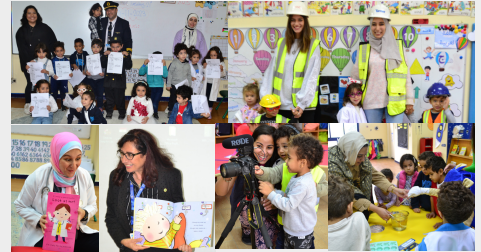
Preschool & KG Career Day