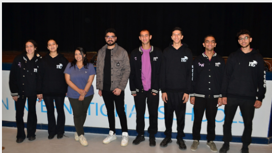
The Student Council and HS students organized assemblies for Middle School , to address significant issues like gossip awareness, fostering sportsmanship, and setting boundaries . These engaging sessions aimed to educate and inspire participants ultimately contributing to a more positive and inclusive atmosphere.