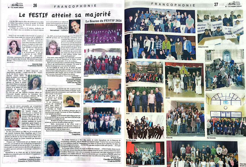
Al-Ahram Hebdo newspaper featured an article highlighting the importance of theater and the significance of the International Festival of Francophone School Theatre. Established in 2002, this year marked its 21st edition that has taken place at our very own NG theater, hosting participants who eagerly await its annual arrival.