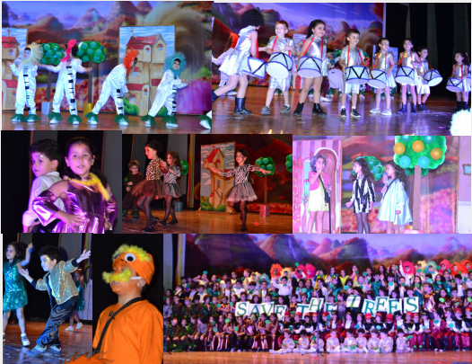
Preschool & KG Show "The Lorax"