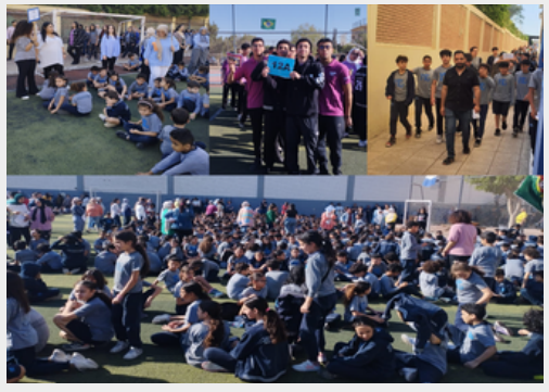
Fire Evacuation Drill