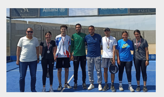
ISSOC Racket Games

The time has finally come to honor our high achievers who participated in NG's religious contests (The Holy Quran – The Hadith – The Prophetic Biography – The Christian Religion Education). Since religion and morality are two sides of the same coin, we decided to present the "Good Role Model Award" in order to enhance and honor the moral aspect of students. We have the pleasure to invite the parents of students, who will be honored, to attend the ceremony on Friday, May 31st , 2024 . All details about the ceremony and the specific timings will be shared soon.