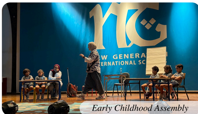
Early Childhood Assembly