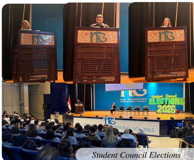
Student Council Elections