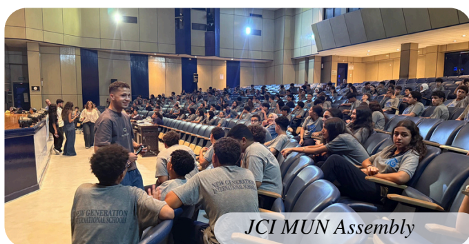
JCI MUN Assembly